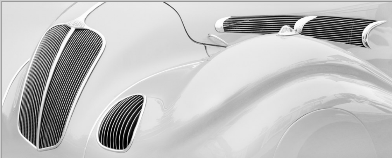
"1936 Delahaye, 2001"