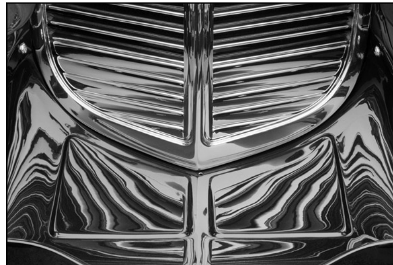
“Grille Detail, 1933 Marmon, 2001”

HW: It very well may. In fact I recall that when we talked about my photography in the initial interview in LensWork #26, I talked a little about the fact that I'm very near-sighted. I tend to miss a lot of the details when I look out at the world. My corrected vision at it's best is about 20/40. It's great for photography by the way, but you probably don't want to drive down the road with me! When I photograph, I