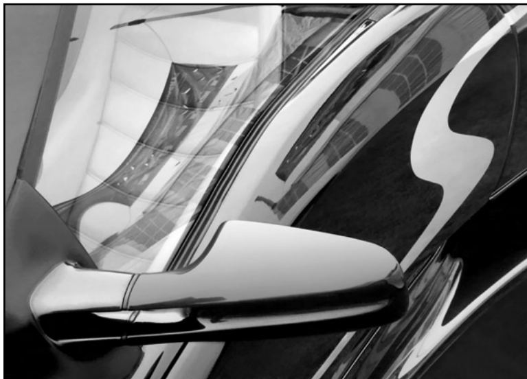
"Lamborghini Diablo SV, 2005"

BJ: I've looked at all of these and, unless I'm missing something, I haven't seen you in a single picture yet!