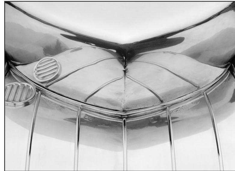
"Bugatti Boatail #3, 2001

HW: I think that's true. I would take it even further to say that I also try to respond to the light in terms of what it's really trying to show, in and of itself. I try to use the light to its best advantage, so it's not just the subject matter.