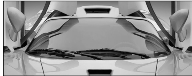
"Saleen SR-7, 2005"